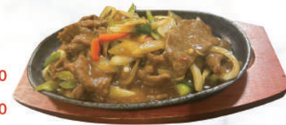
Sizzling Mongolian Lamb