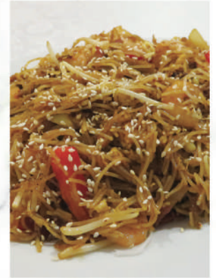
Singapore Fried Vermicelli Noodles