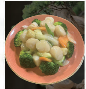
Scallops in Garlic Sauce