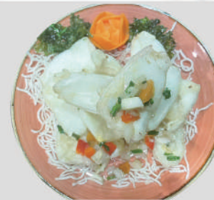
Squid Spicy Salt