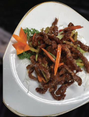
Shredded Fillet Steak Peking Style

We care about all of our customers. If you have a food allergy or special dietary requirement, please inform a member of our friendly staff or ask for more information so that we can organise special dishes for you to enjoy.