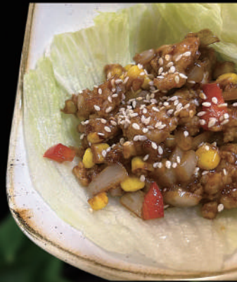
San Choy Bau