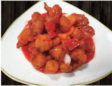
Sweet & Sour Pork