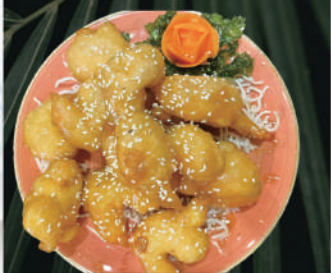
Honey King Prawns