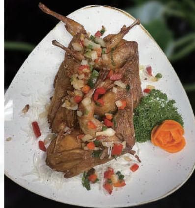
Deep Fried Spicy Quail