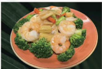
King Prawns in Ginger & Shallot