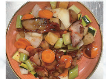
BBQ Pork in Plum Sauce