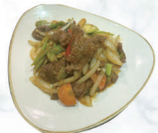
Sliced Beef in Szechuan Sauce