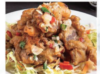
Spare Ribs with Spicy Salt